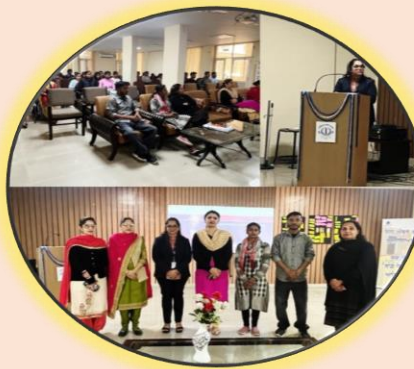
Vocational Training Session