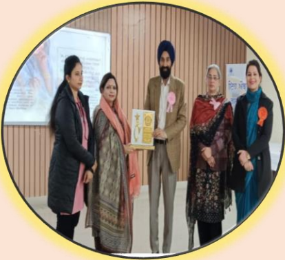
International Women's Day Celebration