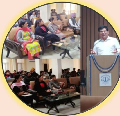
Expert Lecture by Microsoft Teams Head, USA