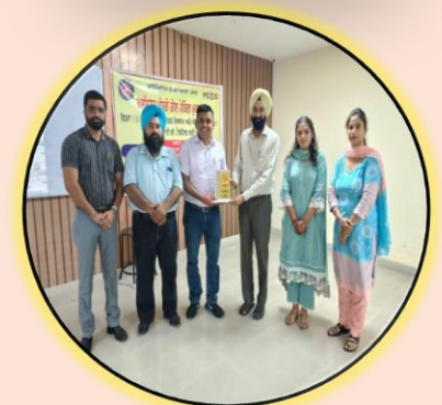
Reel Making Competition by PSACS