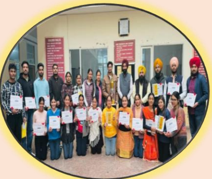
Plasma-2024 (2 nd Runner up Trophy)