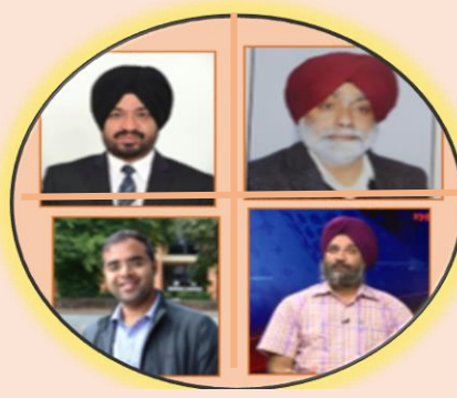
Expert Talk -Resource Persons