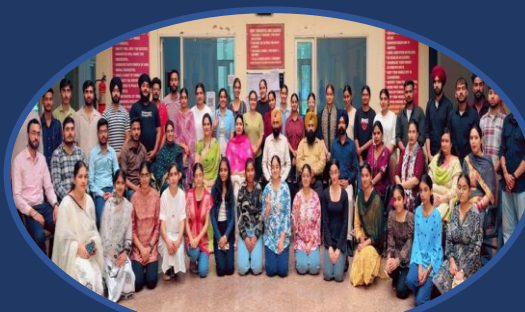
GNDU Youth Festival Team-2026