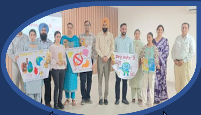
Event on effects of Tobacco