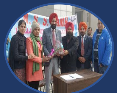
7-day N.S.S Camp in College Campus