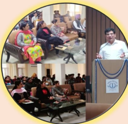
Expert Lecture by Microsoft Teams Head, USA