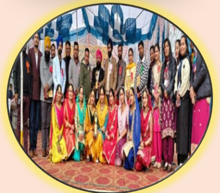
2 Days District Level Youth Festival -2024