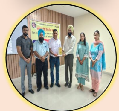
Reel Making Competition by PSACS