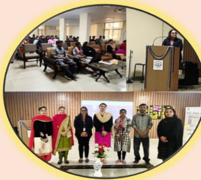
Vocational Training Session